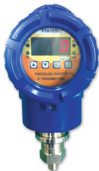
4 Digit LED Segment (4wire)