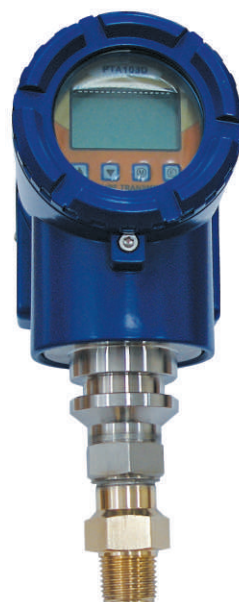
5Digit LCD Bar Graph (2wire)